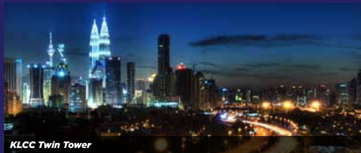
KLCC Twin Tower