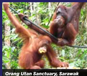
Orang Utan Sanctuary, Sarawak