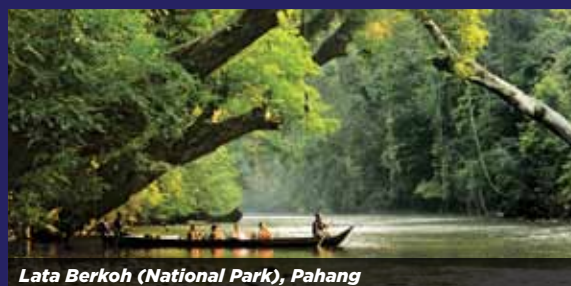
Lata Berkoh (National Park), Pahang