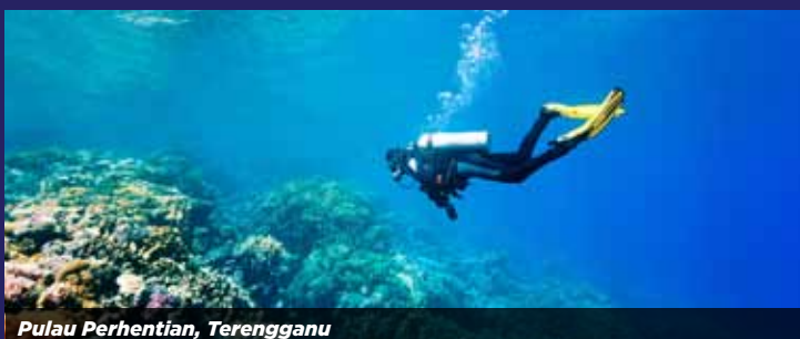
Pulau Perhentian, Terengganu