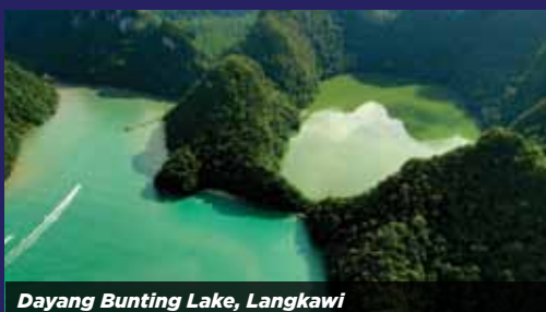
Dayang Bunting Lake, Langkawi