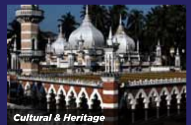
Cultural & Heritage