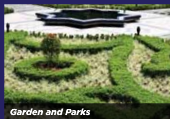
Garden and Parks